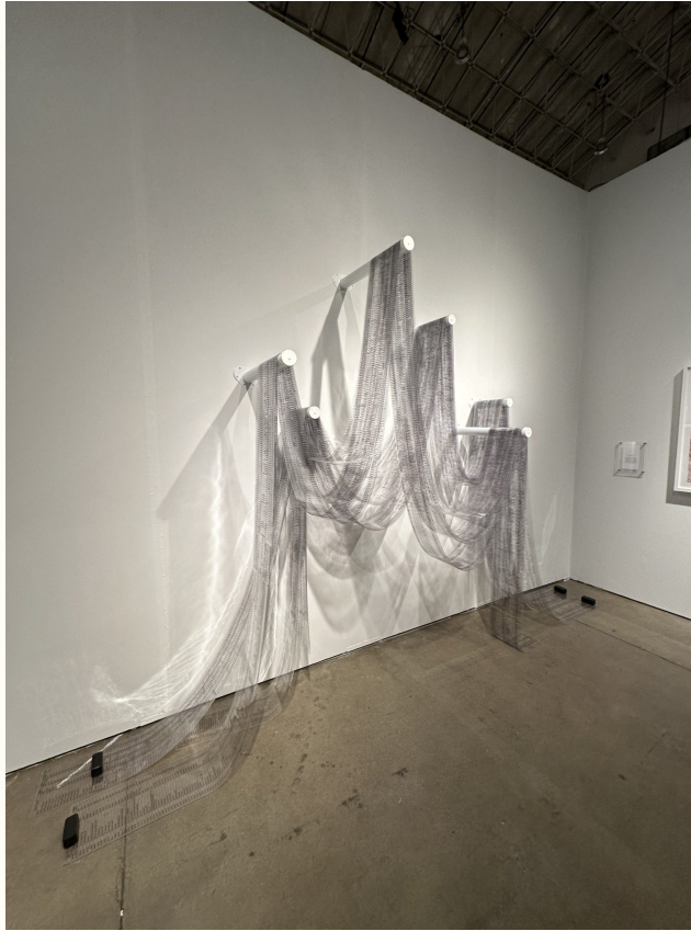
NOME, Berlin (Booth 320)