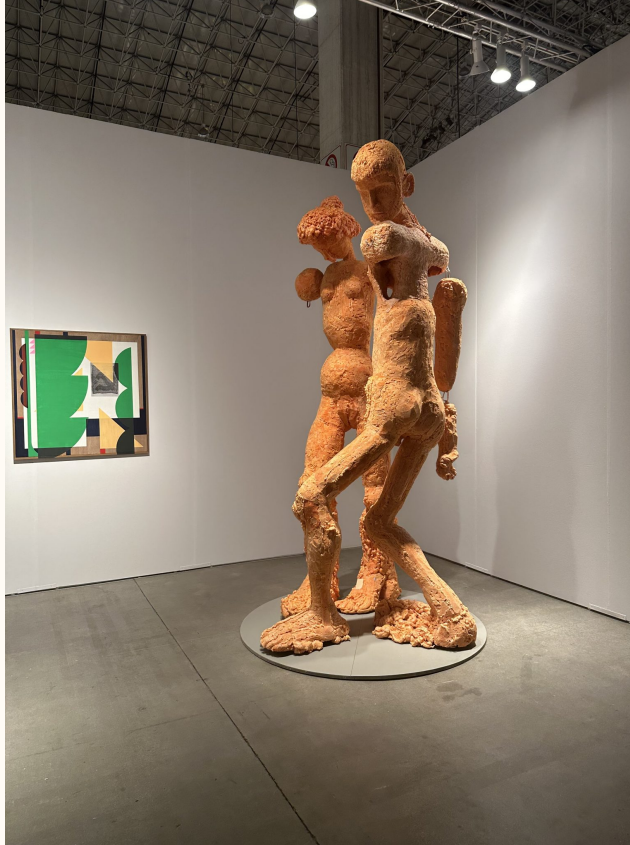
56 Henry, New York (Booth 157)