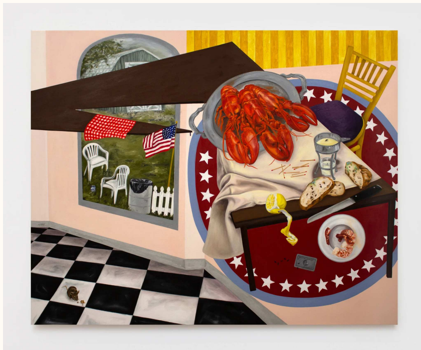
Abattoir, Cleveland (Booth 221)

Chicago mainstay Mickey brought a characteristically curious mix to a booth showcasing the gently unnerving paintings of Ryan Nault (whose work borrows from the visual language of digital displays) along with the brash but intimate sculptures of Amy Stober.