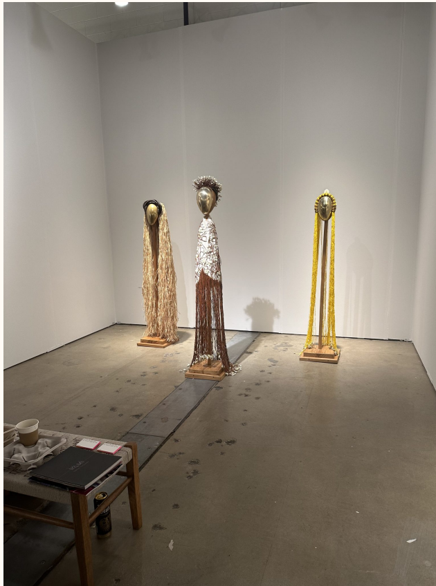
Verve, São Paulo (Booth 431)

Berlin-based NOME's booth devoted to the work of Voluspa Jarpa bears a certain glamorous austerity. The slickness of the artist's hand belies the heaviness of the works' source material, primarily declassified documents from the CIA and historical records of human zoos.