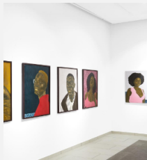
New Gallery Dedicated To Emerging African Artists Opens In Accra