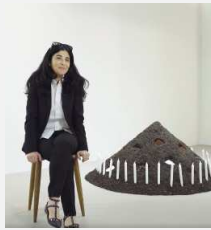
Art from the Global South Brought to the Fore on New Gallery Platform from Liza Essers