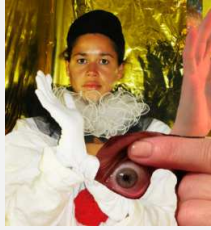
Scotland selects artist for Venice Biennale 2022 Pavilion