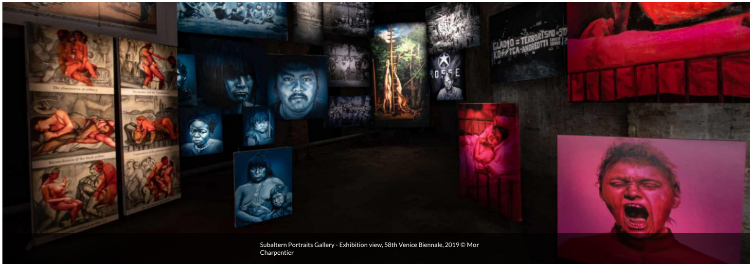
Subaltern Portraits Gallery - Exhibition view, 58th Venice Biennale, 2019

A new biennial prize to celebrate the work of Latin American female artists for their innovation in contemporary art has been created by private banking company Julius Baer and The Museum of Modern Art of Bogotá (MAMBO).